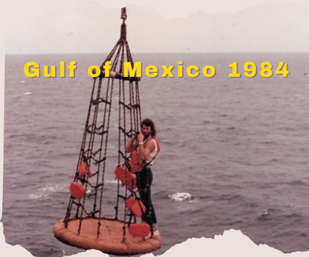
Gulf of Mexico 1984